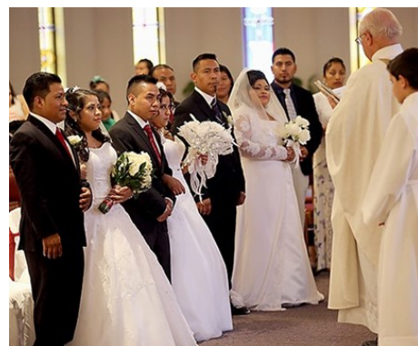
Three couples from our Hispanic community celebrate their wedding in May 2017