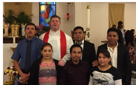
Members of our Hispanic community on the day of their Confirmation

For the Sacrament of marriage in our Hispanic community, we had the blessing of hosting a triple wedding at Saint Ann this past spring, as three brides and three grooms exchanged vows on the same day. "It was their desire, as they said, to be able to participate in the Sacraments of the Catholic Faith and above all, be in state of Grace," that moved them to the altar. This year, 2018, we will celebrate the wedding of two more Hispanic couples from Saint Ann, and it is our hope they are the first of many more!