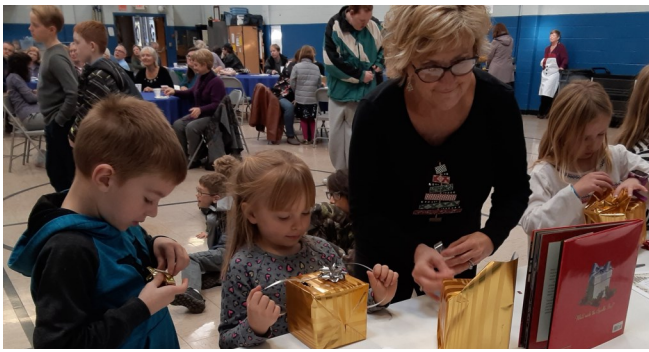
Children made ornaments and Sparkle boxes during the St. Nicholas breakfast.