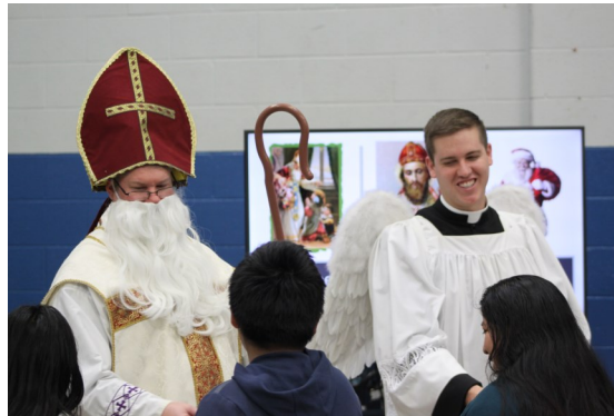
Volunteers and parishioners alike enjoyed the pancake breakfast on December 8.